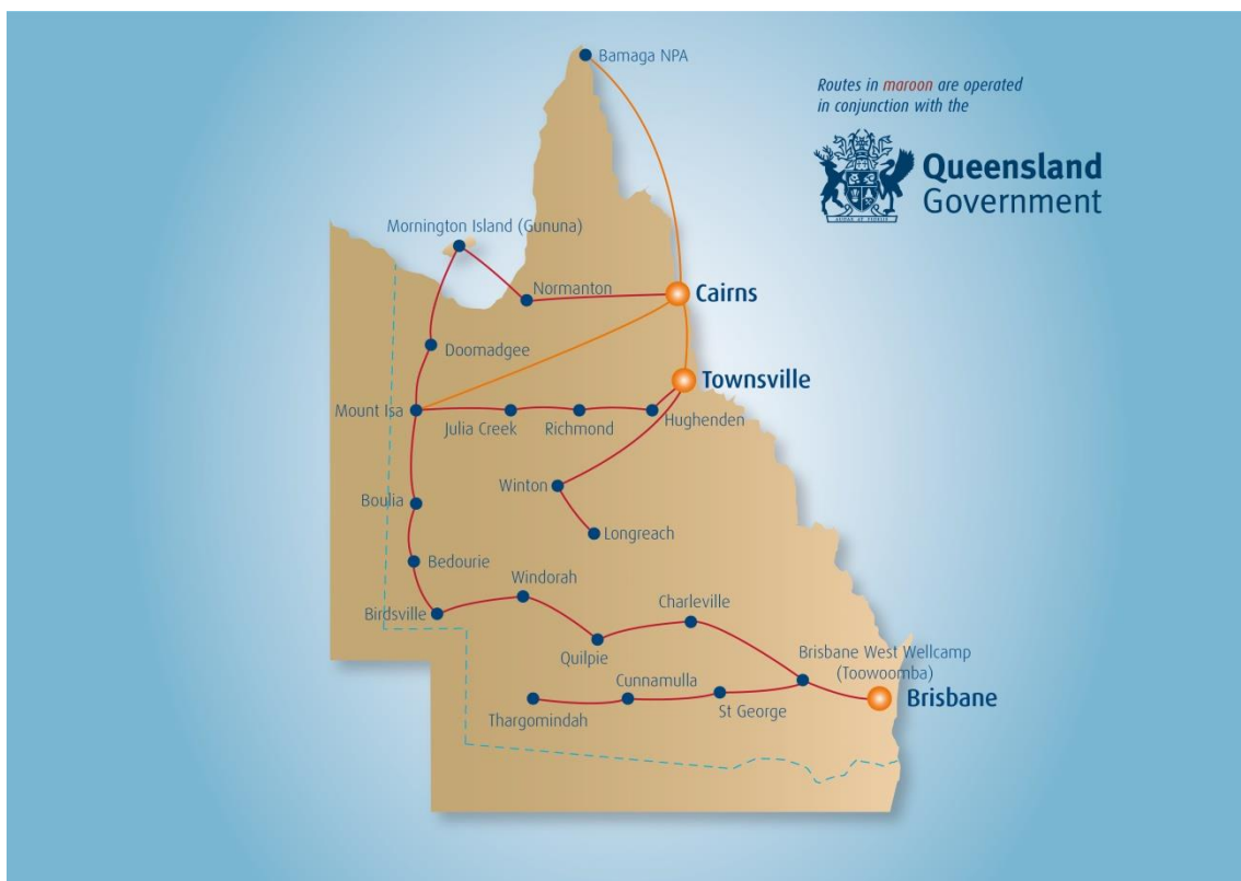
Figure 1 – Queensland Network Map

Funded by Commonwealth Government - Subject to Approval