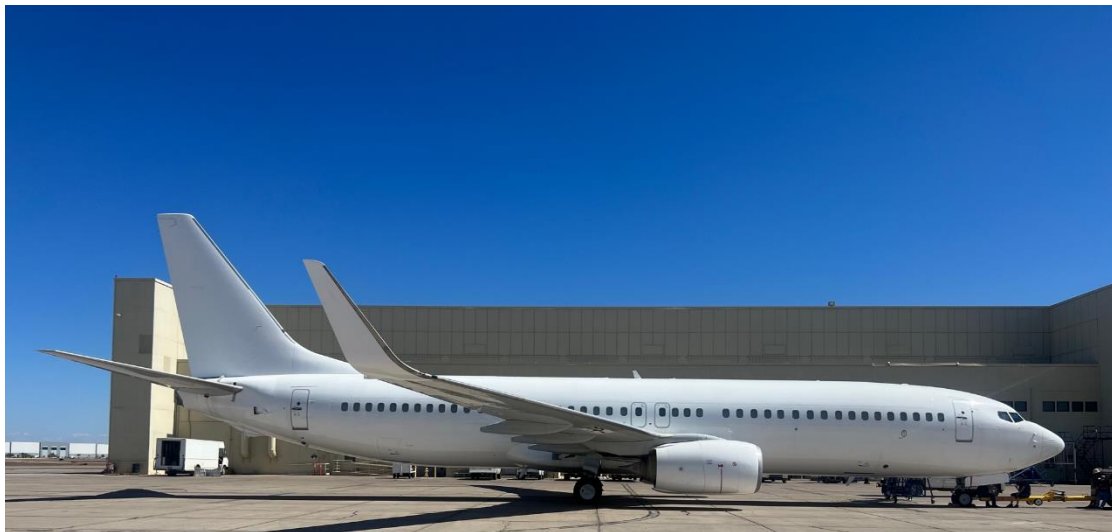
Rex's 10th 737 in Arizona undergoing scheduled maintenance checks.

"Just as Rex has demonstrated for the past two decades in over 50 regional cities, Rex will bring to the major cities a service that is reliable and affordable, delivered with true integrity and heartfelt country hospitality. We invite all cities that want to be part of the unparalleled Rex experience to contact us immediately," he added.