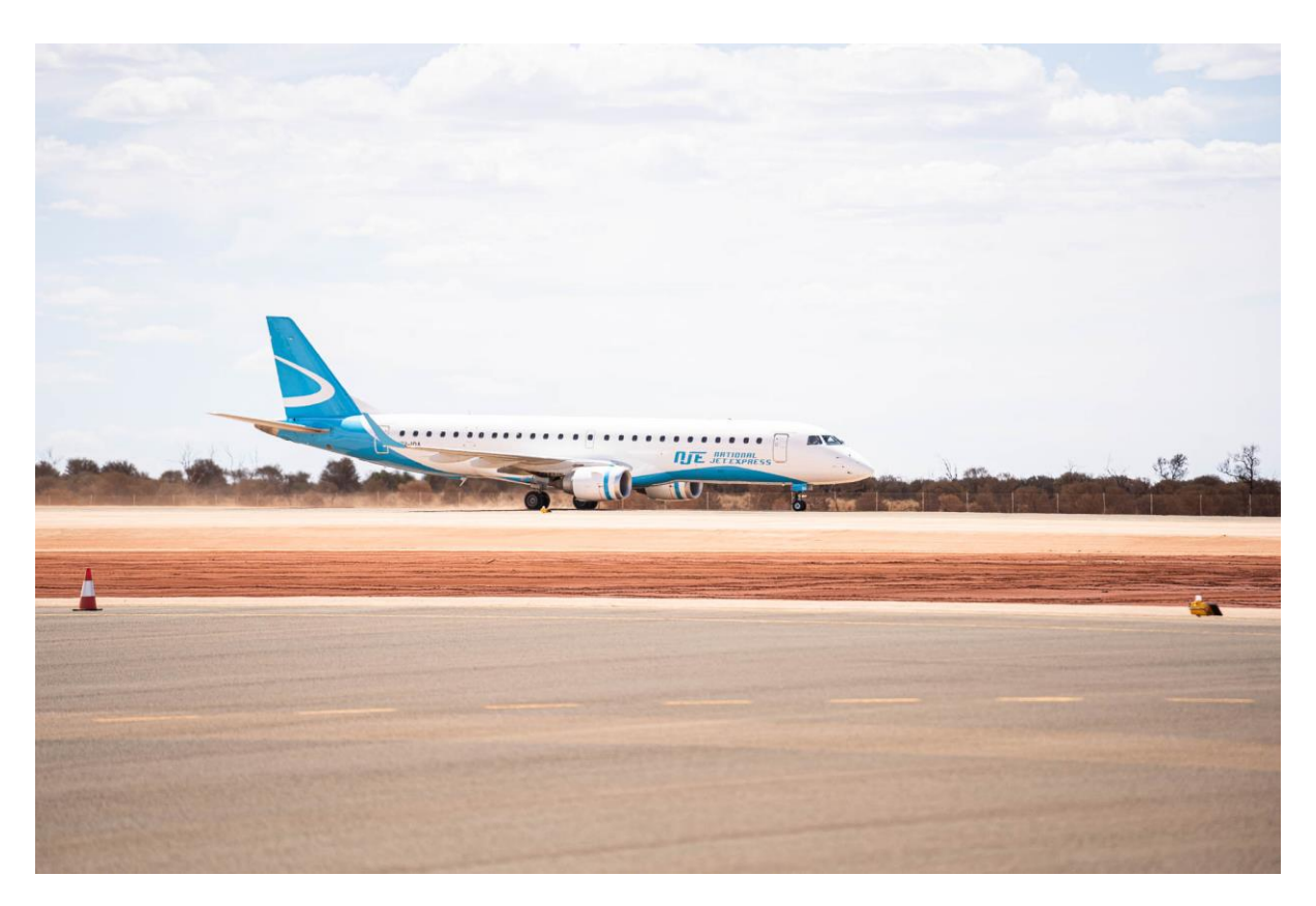
National Jet Express Embraer E190 inaugural flight to West Musgrave.