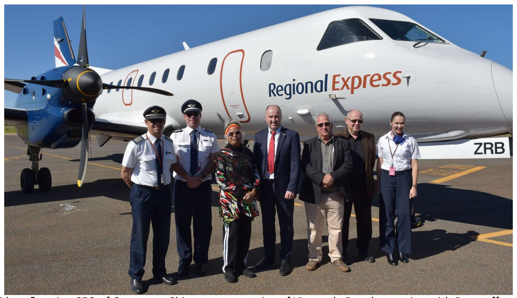
President & acting CEO of Carnarvon Shire, representative of Yingarrda People meeting with Rex staff at Carnarvon Airport