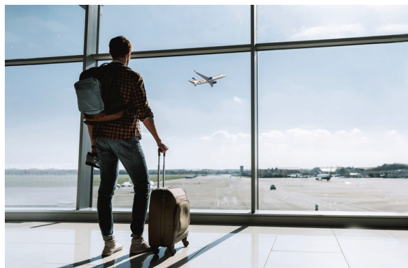
Rex launched its loyalty program, Rex Flyer on 2 October 2023.

Rex registered for the National Greenhouse Energy Reporting Act 2007 (NGER) programme in 2009 and has since submitted NGER reports since FY 2009. Rex submitted its 14th NGER report to the Clean Energy Regulator in October 2023.