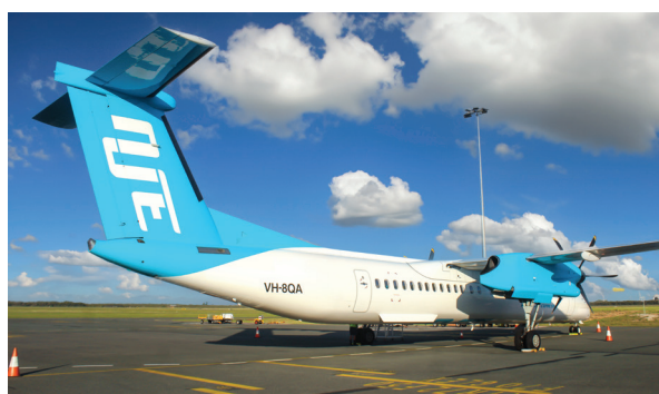
NJE's ninth Dash 8-400NG arrived in October 2023.