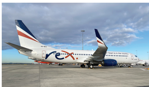
VH-8KH, the airline's eighth Boeing 737 arrived in Brisbane on 28 July 2023.